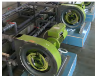
ALP30N lime dosing