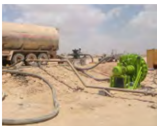
ALH125 crude oil pumping