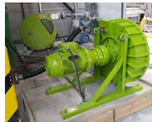
ALHX80 for filter press feeding