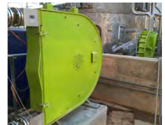
ALX150 and ALH125 for chemical dosing, mining process